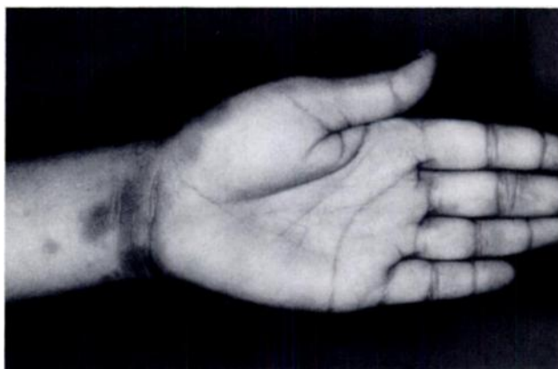
Fig 2. The volar aspect of the wrist and thenar eminence of the hand, with macular hyperpigmentation.

Fixed drug eruption represents a unique form of drug allergy in which characteristic skin lesions recur at the same location each time an offending agent is ingested. This form of cutaneous reaction is observed most commonly in adults but may occur in children or adolescents. 2 Clinically, fixed drug eruptions present as solitary or multiple erythematous macules that often evolve into edematous plaques. 1,2 In intermediate stages they may become bullous and, therefore, must be differentiated from other bullous disorders including acute allergic contact dermatitis, bullous impetigo, bullous erythema multiforme, trauma resulting from a thermal burn, or other less common diseases such as epidermolysis bullosa simplex. Healing of lesions occurs over 10 to 14 days and leaves hyperpigmentation that may increase in intensity with subsequent exposures to the offending agent. Occasionally, however, fixed drug eruptions