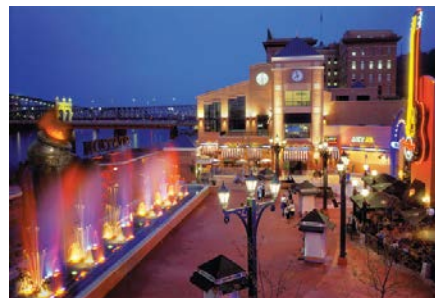
Clockwise from top: Dinosaur Hall at Carnegie Museums, Benedum Center for the Performing Arts, Station Square.