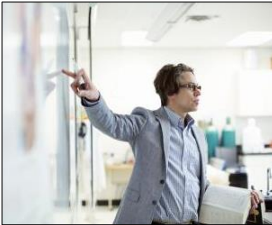
TA's are considered responsible employees