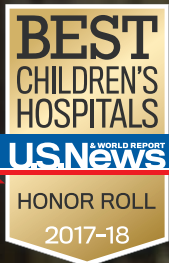
Chart Topper Children's ranked among nation's 10 best

Spine Center treats teen on path to recovery from severe scoliosis